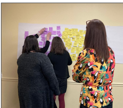
The design team at work on a partner mapping exercise

NOVEMBER 2022 Share the plan with the community. Begin implementation planning for Year 1