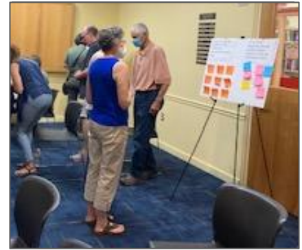
Gallery walks - attendees gave feedback on ten key questions