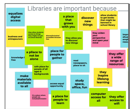
An online Jamboard allowed for virtual brainstorming