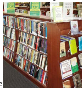
The Friends best-seller fiction books usually go for $1 to $3.