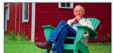
Ted Kooser, Poet Laureate

April 19 - Poetry of Ted Kooser, Poet Laureate. Packets available soon. May 17 - Gilead by Marilynne Robinson. Books available for purchase soon. June 17 - To Be Announced