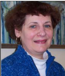
Read about Celia in this issue's Staff Spotlight.