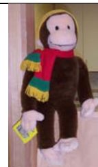
Have you seen Curious George?

The Children's Department is collecting long, paper tubes for summer programs (tubes like the ones from wrapping paper) We will need about 30. If you have any to spare, please bring them to the Children's Department, Lower Level.